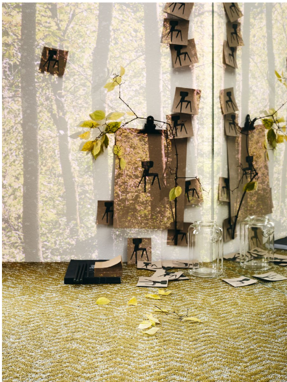
DUO DUNE, color 718 wild safari