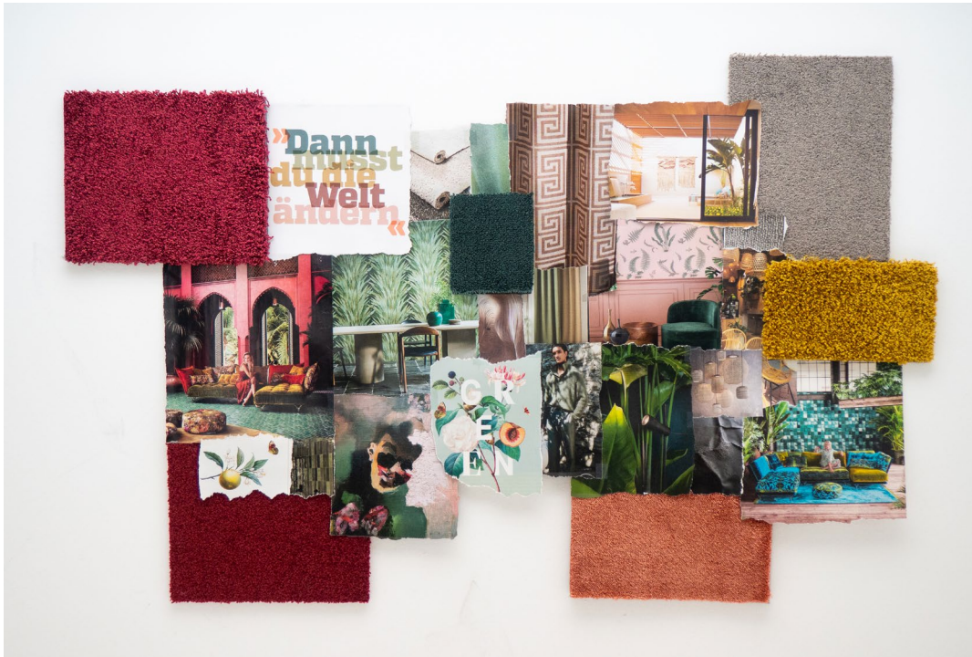
DUO – first available products: SMOOZY, SILKY SEAL, MADRA (from left to right)