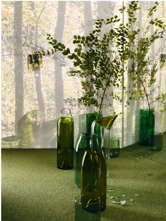
DUO MADRA, color 1135 Matcha